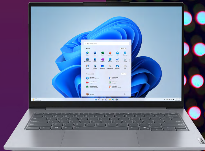
Lenovo ThinkBook 14 Gen 7

Bring out the best in students and educators with AI experiences that are accelerated, safer, and run locally. With the world's largest library of supported AI software, you can rest assured that your classrooms will be ready to take on any task.