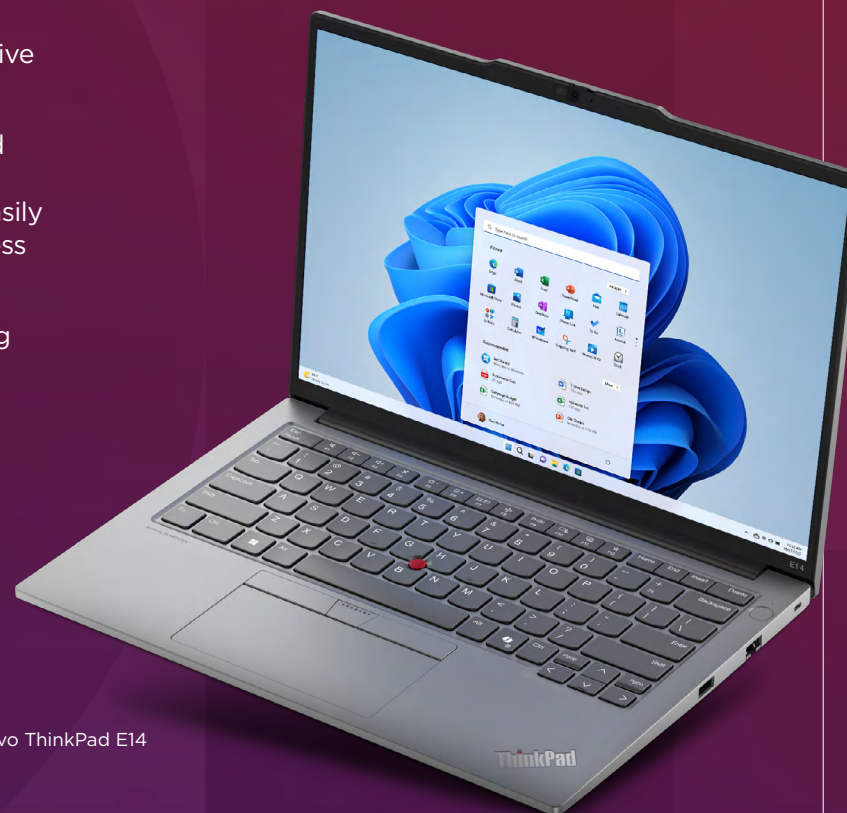
Lenovo ThinkPad E14

Unlock new AI experiences for your classrooms with Intel® Core Ultra processors. From enabling richer student collaboration, to empowering AI infused creativity and productivity in the classroom.